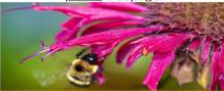
Bee balm ( Monarda didyma ) is another plant bees adore. It produces lots of nectar for pollinators!

For more ideas about bee-friendly plants for summer months visit our summer plants webpage.